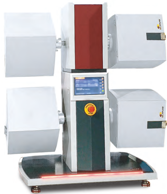
4 Position RotaPill with ICI Pilling and Snagging Boxes