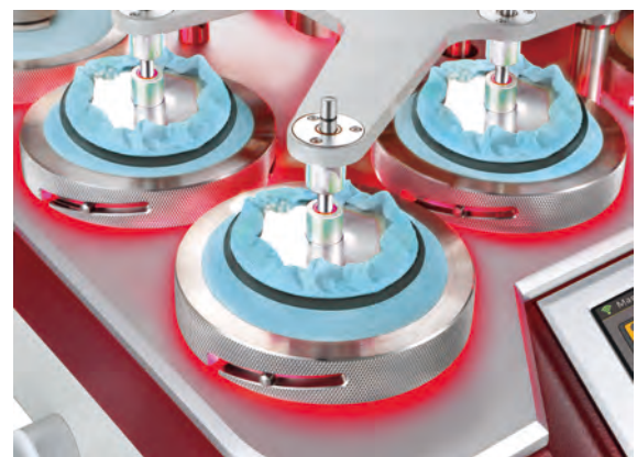
Martindale set up for Pilling Testing

via RemoteAccess, Remote Instrument Monitoring App (iOS & Android) for both operators can now view remaining testing time against the end of a test, giving them full control of the Monitoring App.